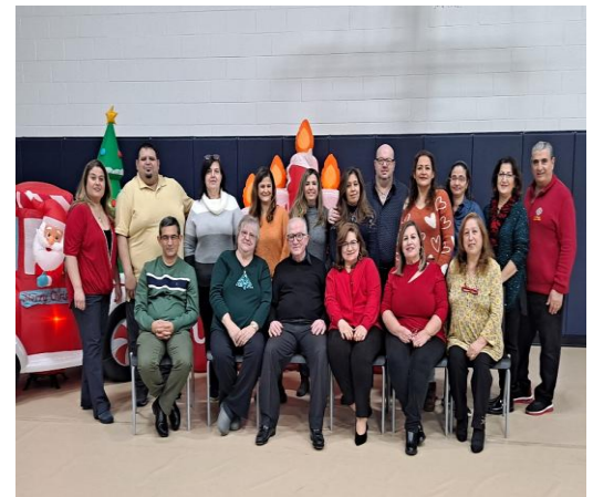
Celebrating Christmas 2022 with Chaldean Deaf Friends