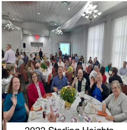
2022 Sterling Heights Diversity Dinner