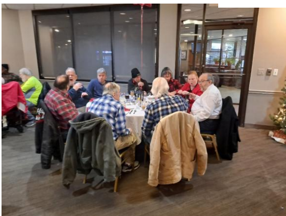
Easter Celebration Lunch 2023