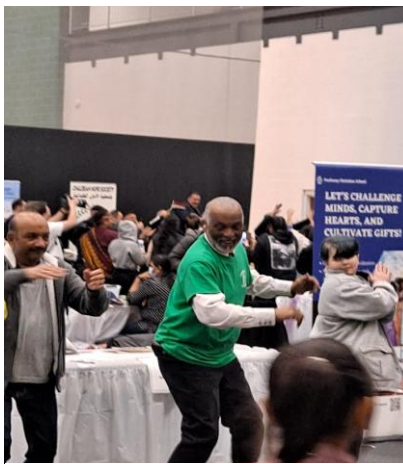
Celebrating at the Sterling Heights Culture Exchange